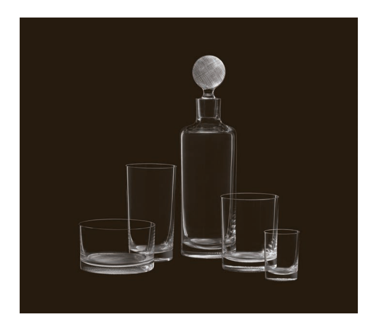
Drinking set no.248 - "Loos"